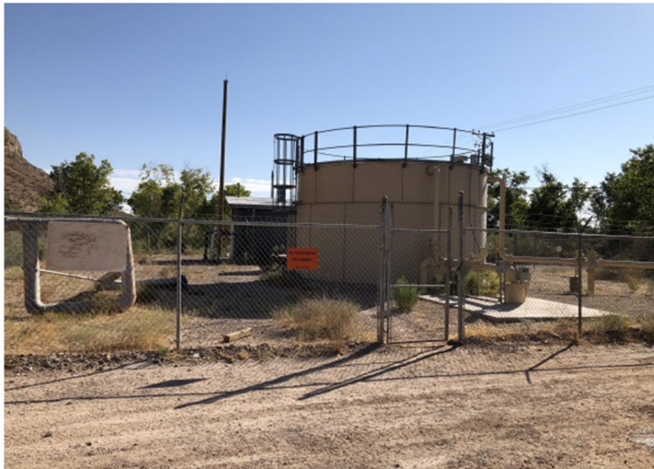
Site 1. Facing East at well site