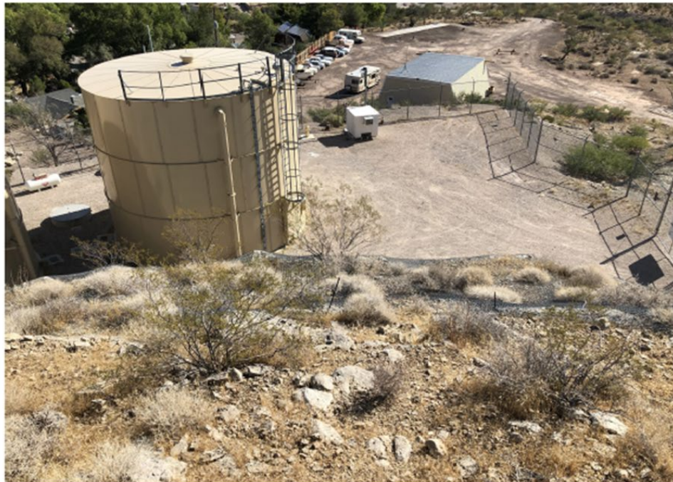
Site 5. Existing tank and partial view of proposed new tank site