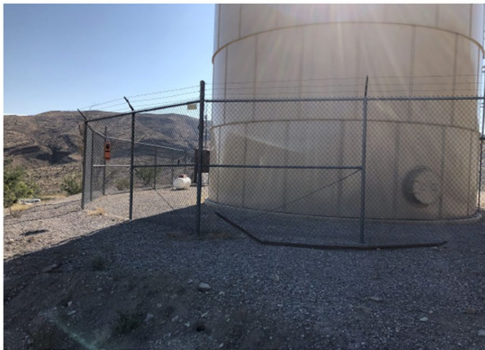
Site 5. Closeup of existing tank