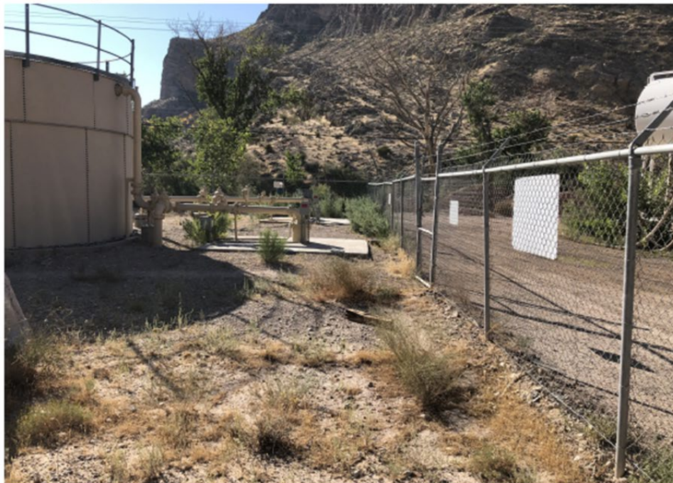
Site 1. Facing South at well site