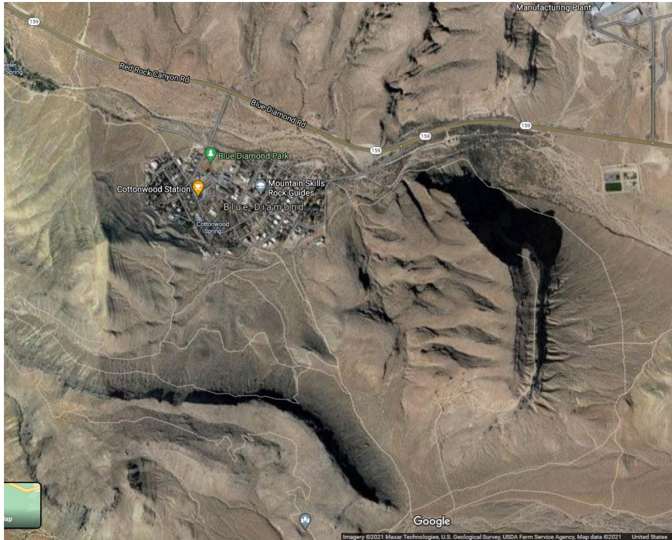
Blue Diamond PWS – general service area