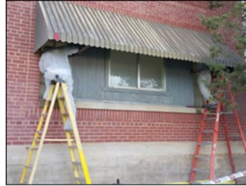
Asbestos abatement workers removing window putty (top photo) and roof mastic (bottom photo)

The McGill Library was renovated and is currently being used as a library, the McGill Town Hall, office space for the town council, and rental space for local residents.