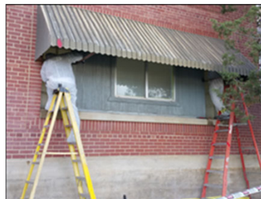
Asbestos abatement workers removing window putty (top photo) and roof mastic (bottom photo)

The McGill Library was renovated and is currently being used as a library, the McGill Town Hall, office space for the town council, and rental space for local residents.