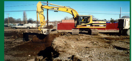
Workers clean up petroleum at a brownfields site in Prineville, Oregon.

Some cleanup activities at sites contaminated by petroleum are not subject to Davis-Bacon Act requirements. Such activities include site remediation through drilling temporary recovery wells, drawing out contaminated soil or water, treating the contaminated soil/water on site, removing the treatment technology and closing recovery wells, and restoration of the area surrounding tank removal that involves only filling and compaction of soil. However, the Davis-Bacon Act does apply to the following petroleum-related cleanup activities: