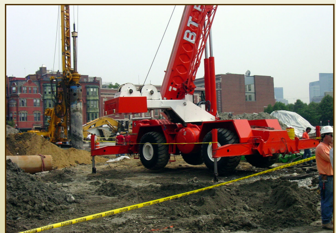
Brownfields cleanup in Boston, Massachusetts.

EPA's Office of Brownfields and Land Revitalization (OBLR) http://www.epa.gov/brownfields • (202) 566-2777