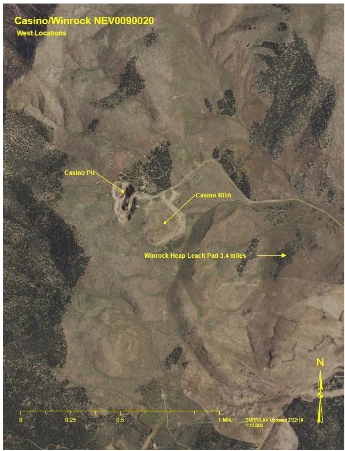
Figure 2 – Casino/Winrock Mine Permit components, monitoring locations, and site map.

Fact Sheet KG Mining (Bald Mountain) Inc. Casino-Winrock Mine NEV0090020 (Renewal 2024, Fact Sheet Revision 00) Page 4 of 13