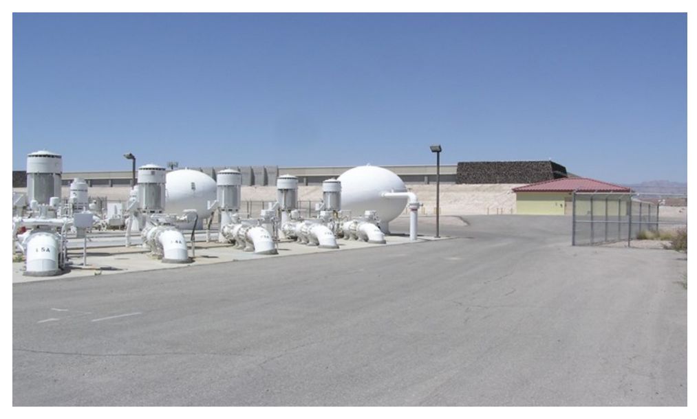
Las Vegas finished water reservoir rehabilitation