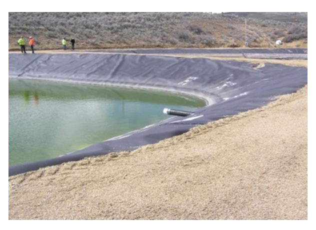
Mountain City pond rehabilitation