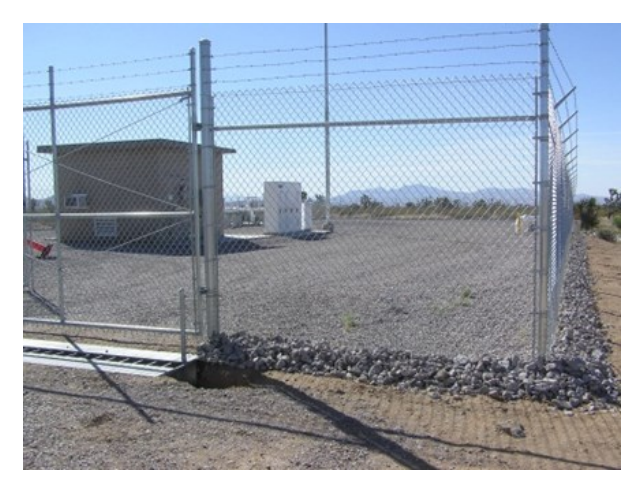
Searchlight new drinking water source

Communities meeting certain requirements could qualify for principal forgiveness loans.