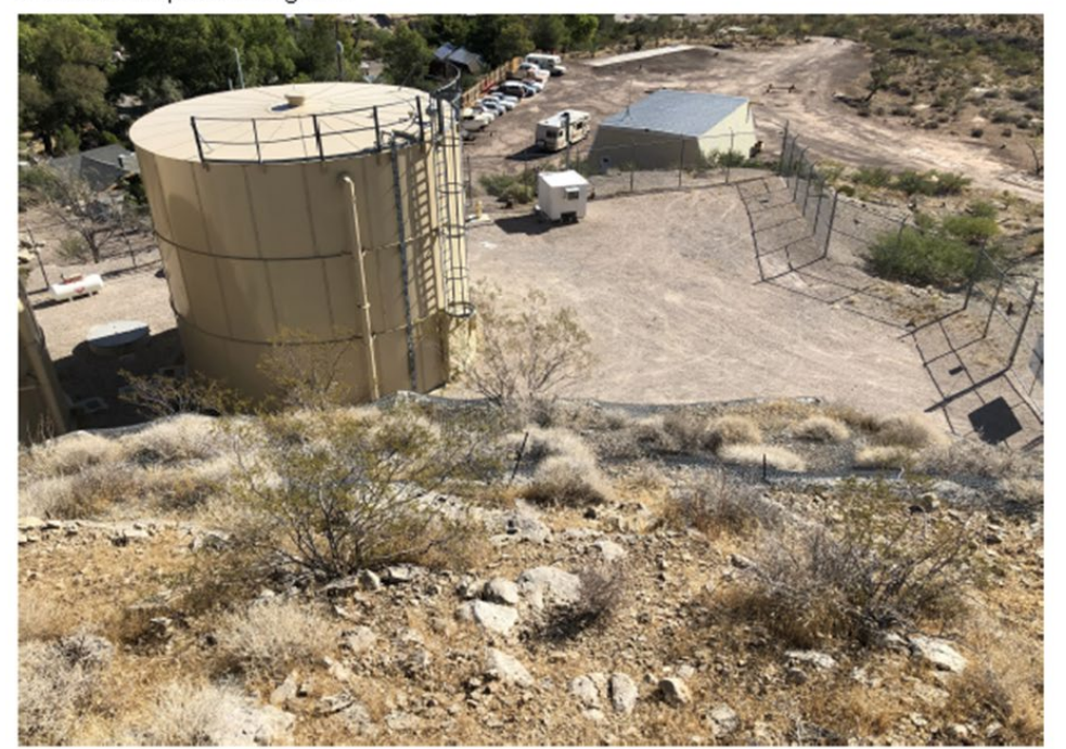
Site 5. Existing tank and partial view of proposed new tank site