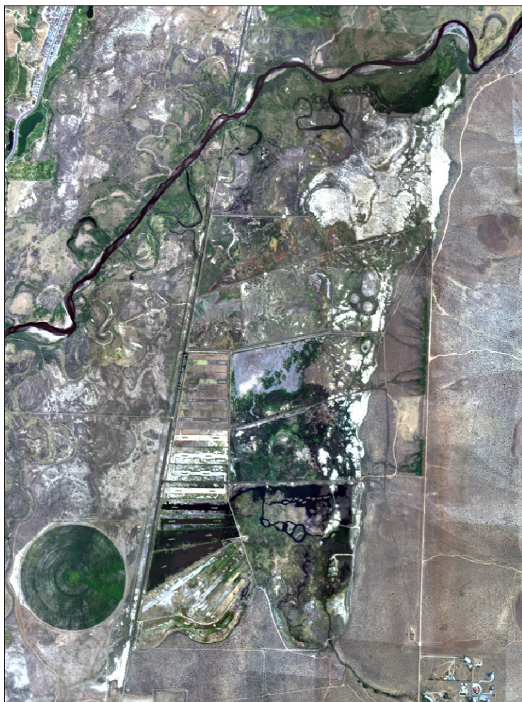
Aerial View of Incline Village GID Wetlands Enhancement Facility In Northern Carson Valley, From Woolpert/BAE Systems, June 2004