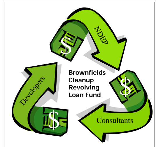
The Nevada BCRLF is a funding mechanism for site cleanup which can be applied on nearly all development projects across the state.

This newsletter is focused on the implementation of the BCRLF and the available tools to promote responsible cleanup and redevelopment of contaminated sites. Certified Environmental Managers should be aware of the re-