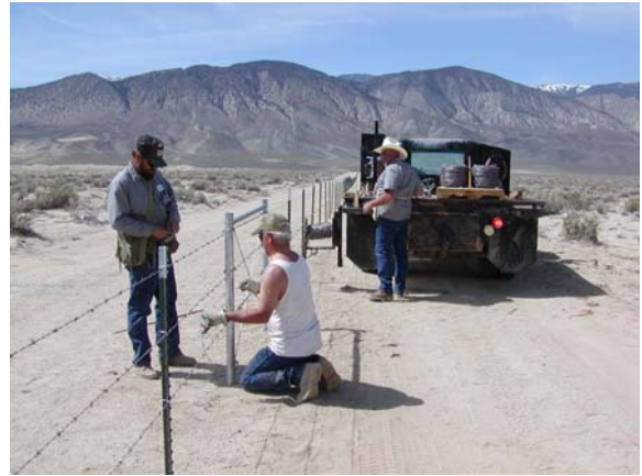
Local labor is used to install a secure fence around the old Hawthorne Landfill, as part of on-going cleanup through the Nevada Brownfields Program.

Beyond providing funds to clear away environmental concerns at Brownfields sites, the Nevada Land Recycling Program is also able to initiate relationships between municipal governments, private investors, and other state and local redevelopment agencies to promote brownfields redevelopment; it is this relationship building which can prove vital to economic revitalization in distressed communities.