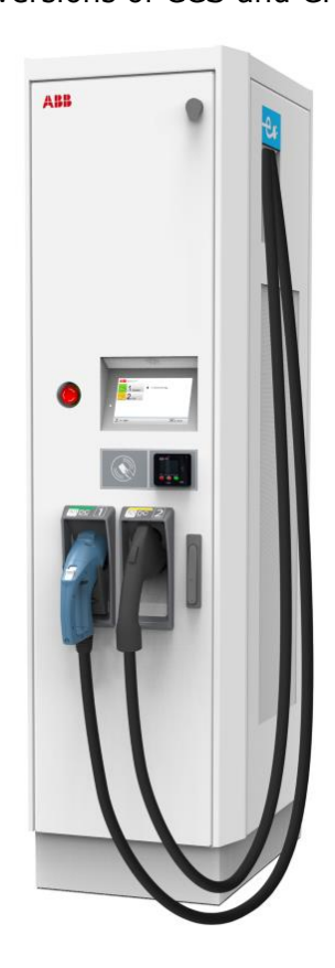
ABB Inc. 4050 E. Cotton Center Blvd Phoenix, AZ 85040 www.abb.com/evcharging

With thousands of DCFC units deployed in around 70 countries worldwide, ABB's Terra platform is the proven, reliable solution to address EV fast charging needs for drivers at retail centers, travel stops, convenience stores, urban parking, campuses, fleets and OEM development applications. ABB's 50 kW DC Fast Charger Terra 53 CJ UL combines industry standards with fast charging technology to support all current and next generation electric vehicles, meeting all, and latest versions of CCS and CHAdeMO.