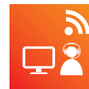
Communication & Management