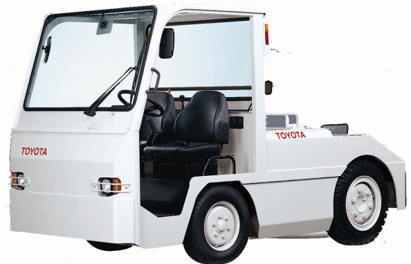
Photo may portray optional equipment not included in your quotation.

Featuring a Toyota designed AC Drive and MOSFET transistor control system, the 2TE18 offers smooth acceleration, improved battery efficiency, and top travel speed loaded or unloaded. The forklift style drive motor/rear axle assembly offers transverse mounting of the motor to allow a very compact drive assembly while delivering excellent durability, power, visibility, and gradeability. A standard digital display offers on-board diagnostics, 2 speed travel control, four password protected performance parameters, and full hour meter functions.