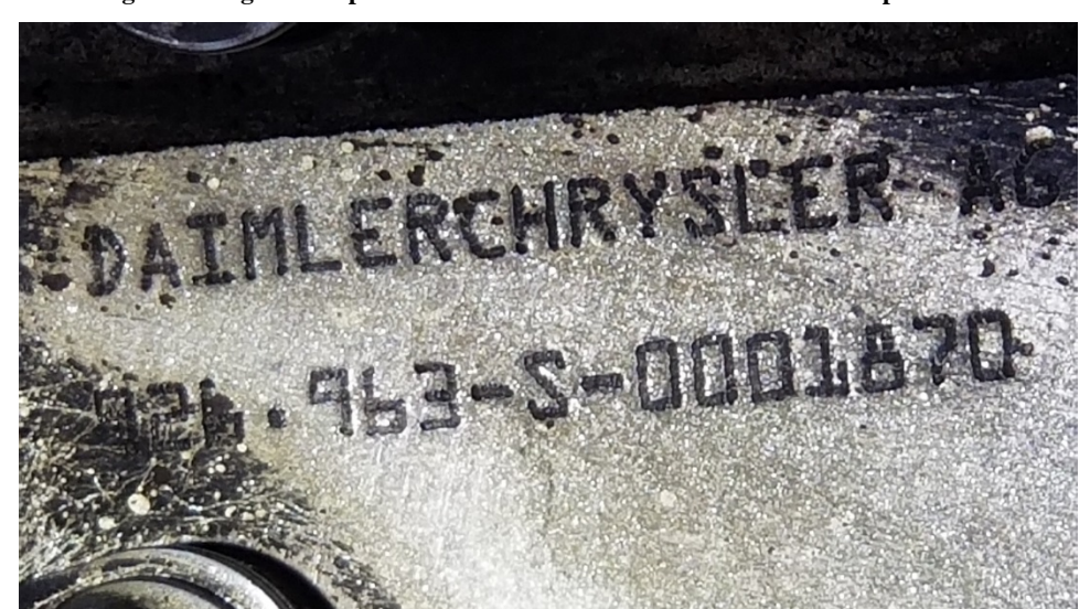
Figure 2: Engine stamp on one of CCSD's school buses selected for replacement

The City of Reno's five diesel-powered service vehicles operate within the Truckee Meadows (Hydrographic Area 87) and more broadly the entirety of the City of Reno to support the maintenance of roads and other critical City infrastructure. Four of the vehicles selected are vehicle model year 2002/engine model year 2001 combination plow/dump trucks and the fifth vehicle selected is a vehicle model year 2001/engine model year 2000 boom truck. These vehicles will all be replaced with diesel-powered vehicles powered by engines meeting a 2016 model year or newer engine certified to EPA emission standards.